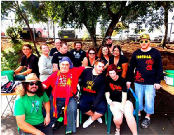
The Bridge with a whole bunch of supporter at the Lismore Carboot Market where we were generously allowed to be Charity of the Month