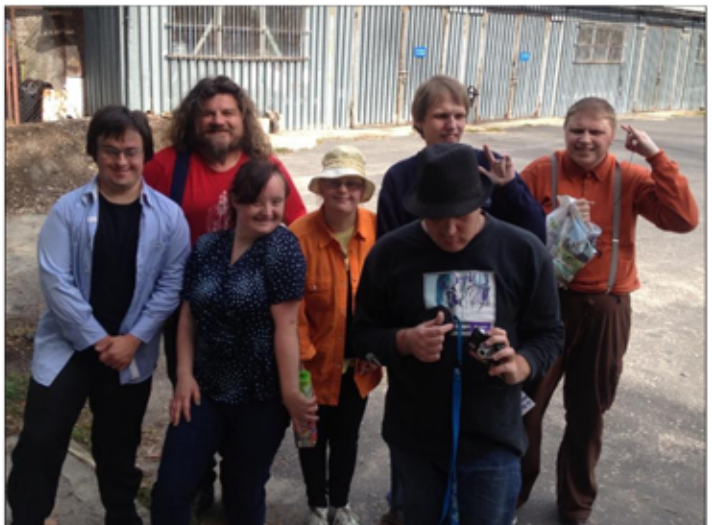
Members from The Bridge and Remont pomp post collaborative Jam