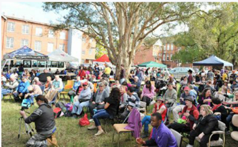
Hundreds of people on the lawns at Seespace for the Lark in the Park