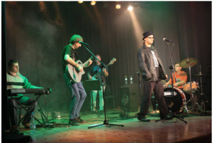
Na Gozre - To The Top, - the other amazing band we toured with from Poznan.