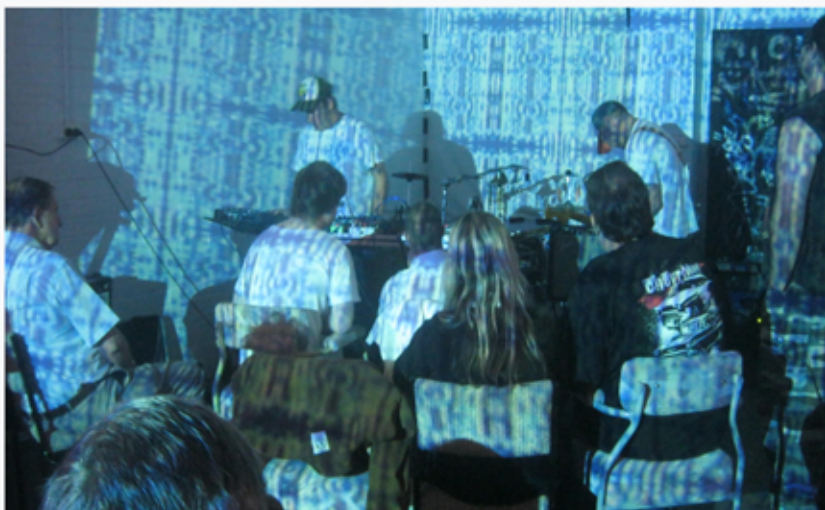
Lawn Cigar playing their debut gig at White noise